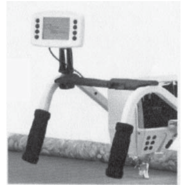
QuiltMotion Designed for BERNINA